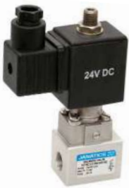
2 / 2 Way Solenoid Valve