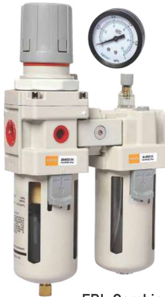
FRL Combination Unit