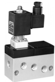
Pilot Op. Solenoid Valve