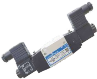
5 / 2 Way Solenoid Valve