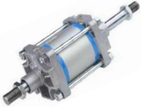
Double Ended Cylinder