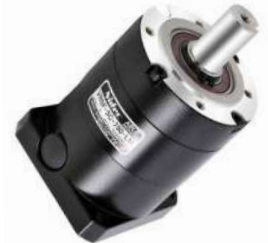
Planetary Gear Box