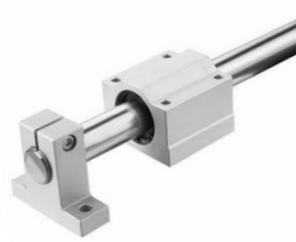
Round Rail & Bearings