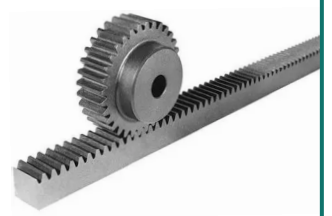
Rack & Pinion