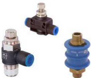
Air Line Valve