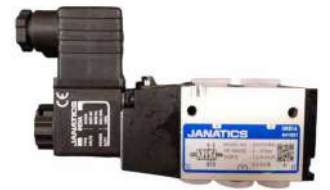
5 / 2 Way Solenoid Valve