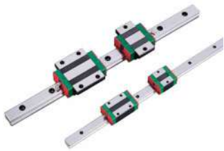
Square Rail & Bearings