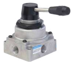
Liver Op. Valve