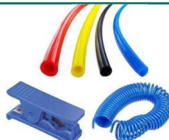
Tubings / Tube Cutter