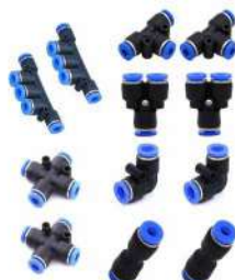
Push-in Type Connector