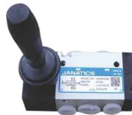
Liver Op. Valve