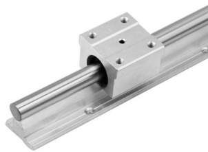
Linear Rail & Bearings