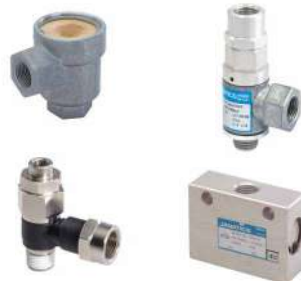
Air Line Valve