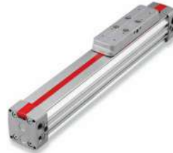
Linear Drive Unit